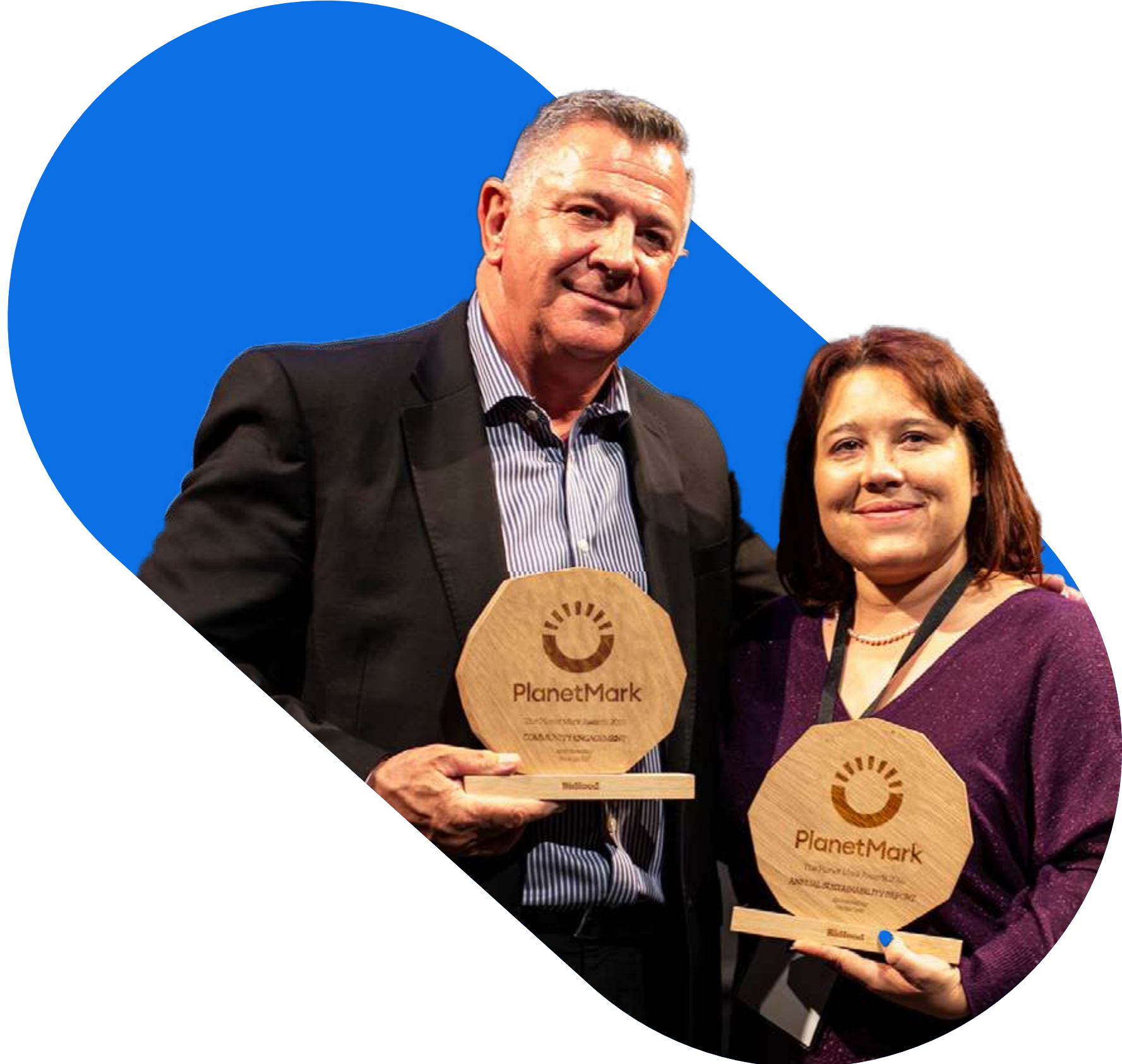
Planet Mark Awards 2021 highlights