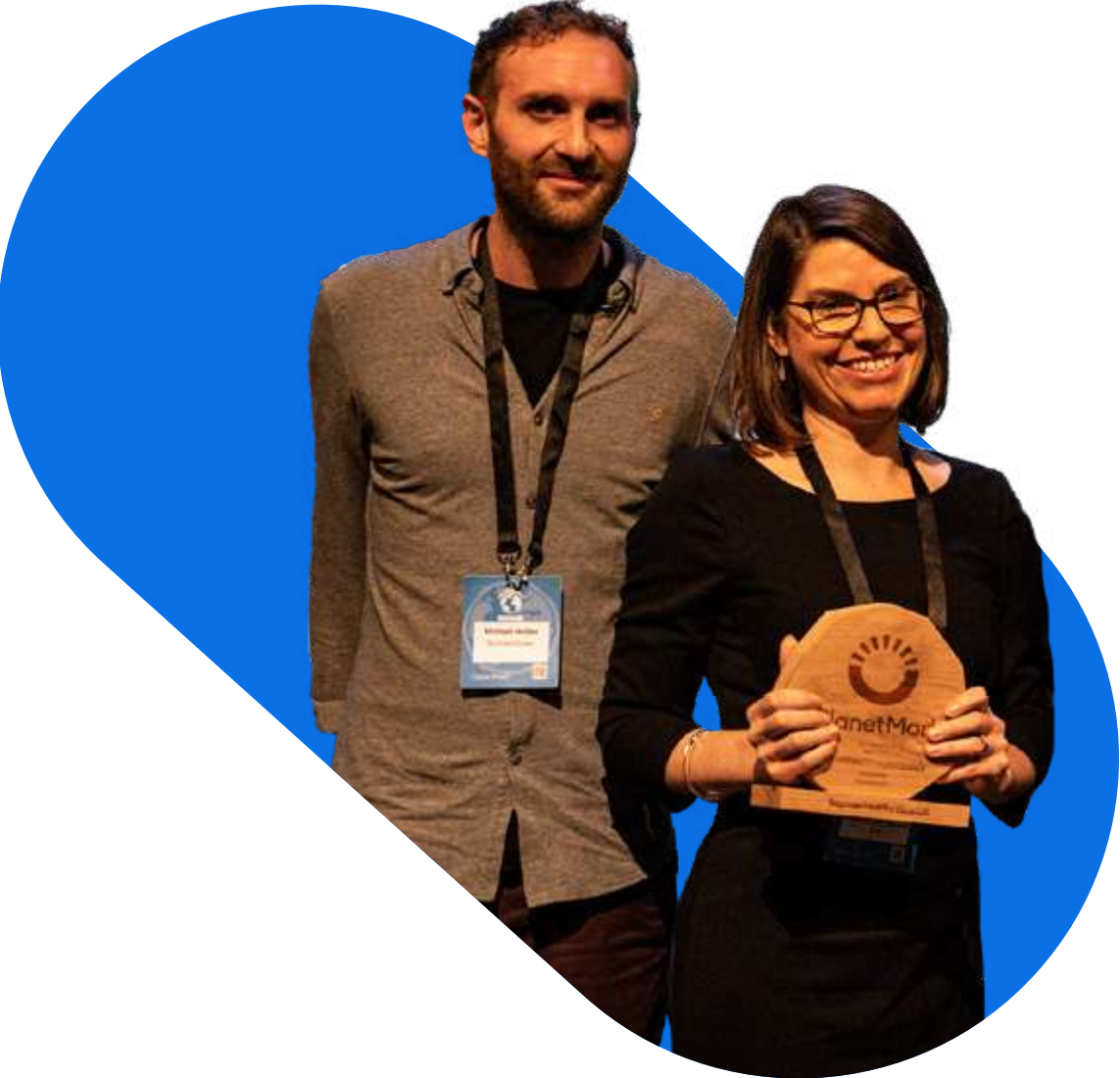
Planet Mark Awards 2021 highlights